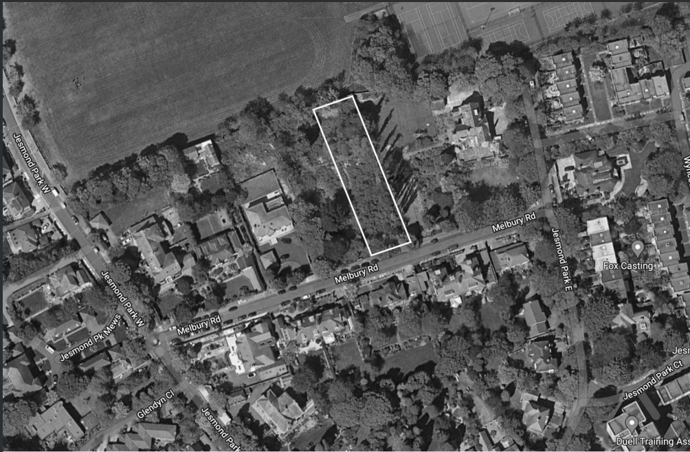
Please note this aerial shot is for illustrative purposes only